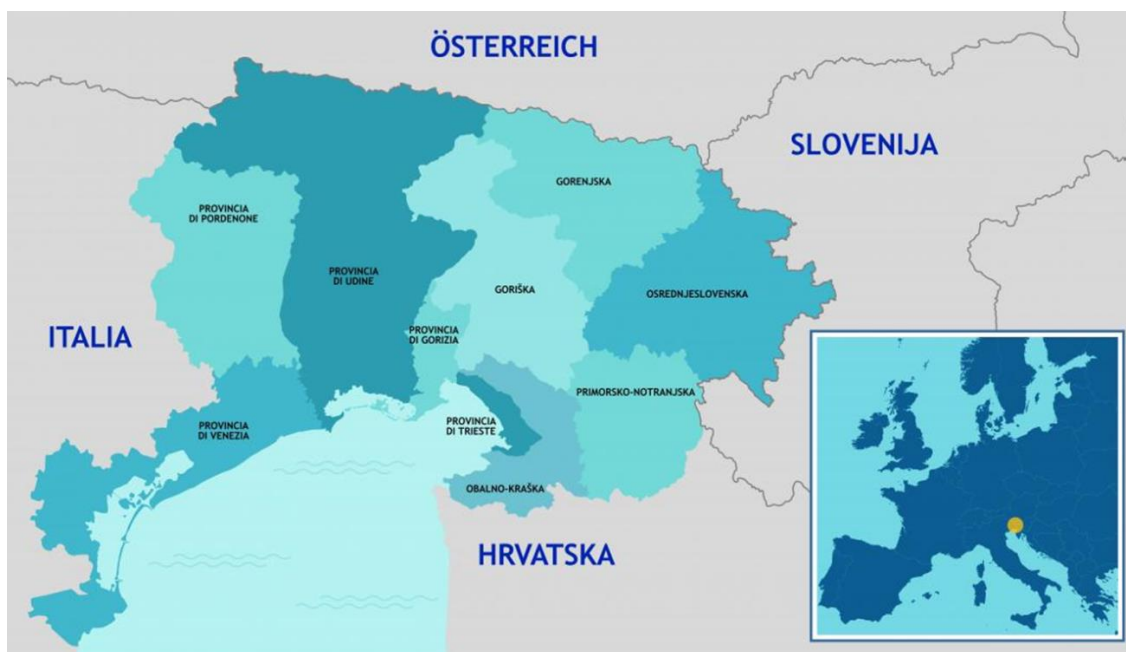
Figure 2: borders of the INTERREG ITA-SI programme area included in this study

This database, which resembles a list of stakeholders, was established based on study of publicly available databases (e.g. database of economic activities, regional and national data on waste production), internet findings, especially web-pages of stakeholders, and personal interviews. Databases were first refined according to the geographical borders of the INTERREG ITA-SI programme area, which can be seen in Figure 2.